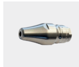
RD Mono (up to 2000 bar)

The water tool for pros. Thanks to its compact and light-weight design, enduring, fatigue-free work is possible. The Masterjet ensures a long service life thanks to the use of the patented HPS sealing system and robust components.