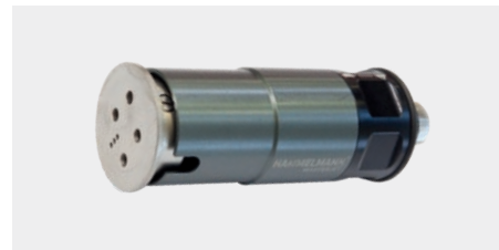
RD Masterjet (up to 3200 bar)

The water tool for pros. Thanks to its compact and light-weight design, enduring, fatigue-free work is possible. The Masterjet ensures a long service life thanks to the use of the patented HPS sealing system and robust components.