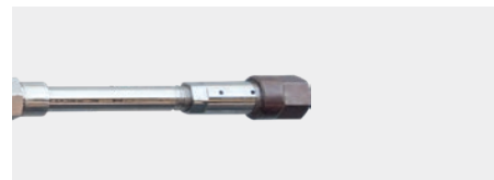
Fan jet nozzle (15°)

High-pressure spray gun SP 3000 E with electrical connector Hammelmann high-pressure spray guns are designed for demanding, industrial use. The ergonomically shaped handle and various extensions are easy to install.