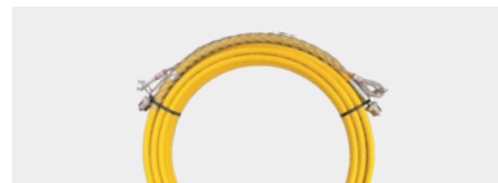
High-pressure hose (20 m)