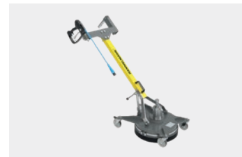
Aquablast Basic E

The smallest of our Aquamat tank cleaning units impresses with its patented HPS technology, which is also used in our Masterjet rotor jets.