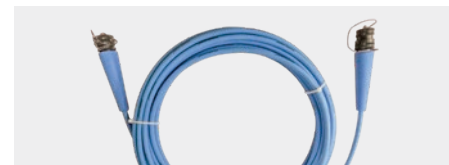
Control cable (25 m)