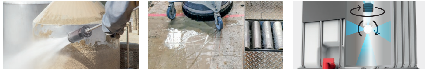
General gun blasting work Surface cleaning